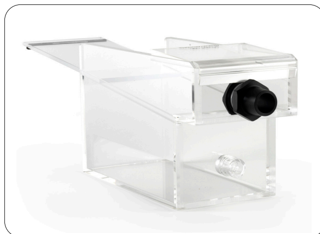
Figure 2. The RAS-4 comes with an oversized, vented induction chamber that will accommodate five mice or two rats.