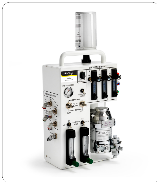
Figure 1. The RAS-4 provides four anesthesia ports, to deliver isoflurane to two imaging systems, the induction chamber and one additional accessory simultaneously while providing dedicated scavenging of anesthesia, reducing exposure to the user.